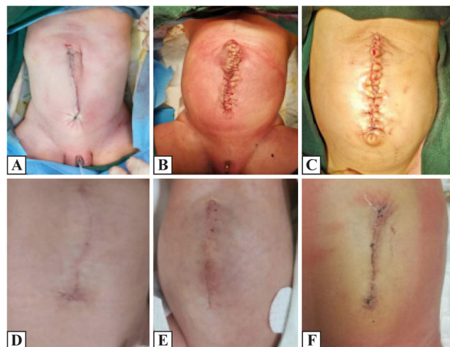
Figure 2 Previous surgical methods for giant omphalocele. (A–C) Postoperative abdomen and postoperative umbilical morphology. (D–F) The results suggested that the umbilical cord was not natural after surgery, and the follow-up indicated its flattening and disappearance.