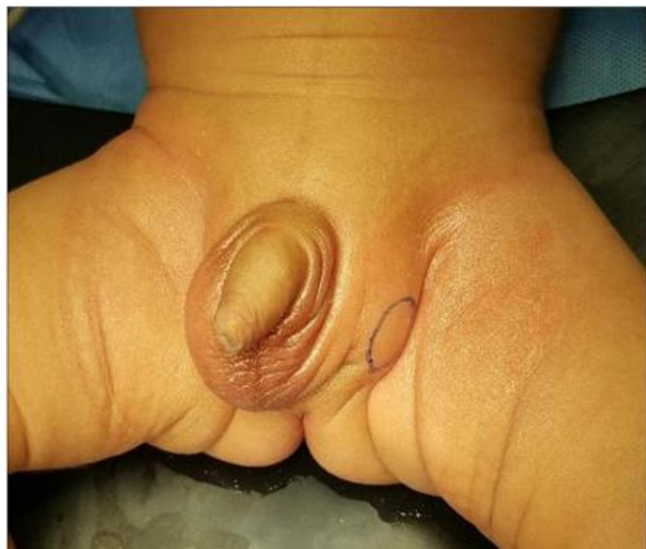
Figure 3 Left ectopic femoral testis.

diagnosis of perineal ectopic testis was suggested and confirmed by an ultrasound examination. Operation was offered and surgical exploration was performed through left inguinal incision, the spermatic cord was delivered to the wound, the testis with its gubernaculum was released from its attachment to the perineum, gently delivered into the inguinal wound and fixed in the ipsilateral scrotum using dartos pouch technique (figure 2). Post-operative follow-up after 2 months revealed a normally located left testis in the scrotum and the parents were satisfied with the outcome of surgery.