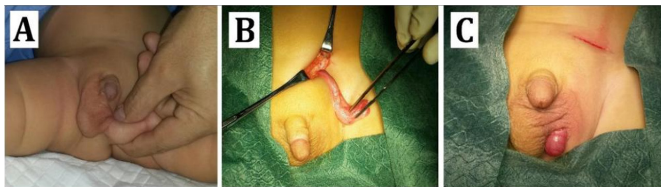
Figure 2 (A) Palpation of left ectopic perineal testis. (B) Intraoperative delivery of ectopic testis with sufficient length of cord. (C) Left orchiopexy in sub-dartos pouch.

Parents of an infant 4 months of age were advised by the nurse to visit a doctor because of accidental finding of non-palpable left testis in scrotum during circumcision procedure since the age of 3 months. When the parents consulted me, there was impalpable left testis neither in the scrotum nor in the inguinal canal with retracted underdeveloped hemiscrotum. An oval-shaped soft tissue mass was detected in the perineum (figure 2), a clinical